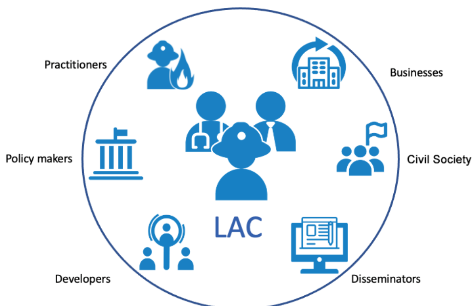
Figure 2: LAC composition

At M25, two LAC meetings have taken place in LINKS. The current LAC composition, as well as the main results of the first LAC meeting (held virtually in January 2021), were presented in section 6 of the D8.4.