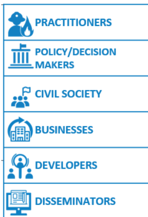
Figure 4: Updated categorization of LINKS Target Groups

Based on the recommendations included in the 'Project Review Report', this section provides an updated version of the LINKS target groups, as presented in the image below. The main rationale behind the revisited categorization of the project's target groups is the need to better consider their needs and expectations. A clear description of the contribution the different target groups can give to LINKS, as well as the benefits they can derive from the LINKS activities, is provided in D9.2: Updated LINKS Dissemination, Exploitation and Communication Strategy (Opromolla, A. 2022).